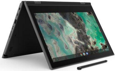
Lenovo 500e Gen 4 Chromebook $587.50